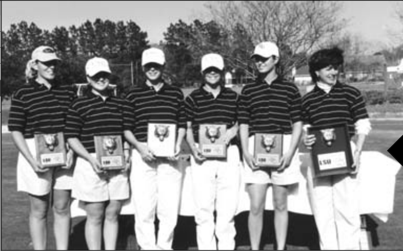
1998 Fairwood Invitational Team Champions