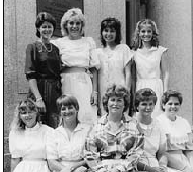
1985-1986, Ninth Place NCAA Championships