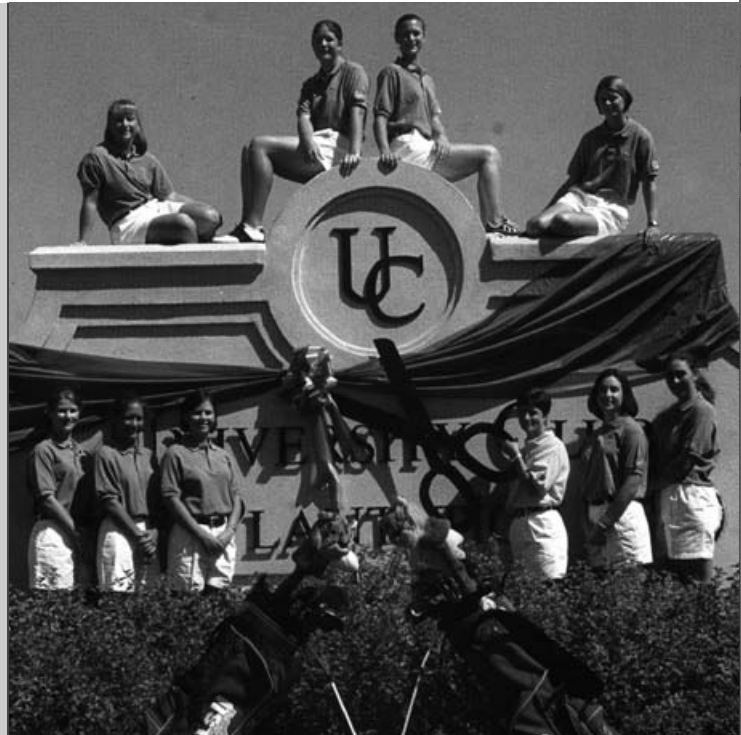
The 2000 LSU team cut the ribbon and won the first LSU/Cleveland Golf Classic at the University Club.