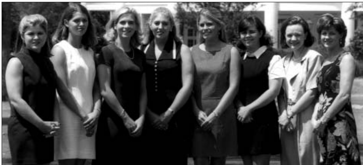
1997-1998, Fifth Place NCAA Championships