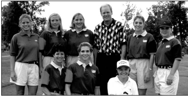
1995-1996, Eighth Place NCAA team with PGA star Johnny Miller.