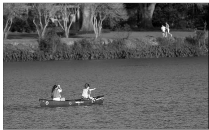
The University lakes on the LSU campus give various recreational options.

Having witnessed many of yesterday's possibilities become today's tangible realities, the LSU community set forth to capitalize on its success. The goal was to improve our standing as a nationally competitive flagship university. Following intense discussions among the LSU Board of Supervisors, campus administrators, faculty, and student leaders, the objectives required to reach this status crystallized, providing the impetus for LSU's National Flagship Agenda.