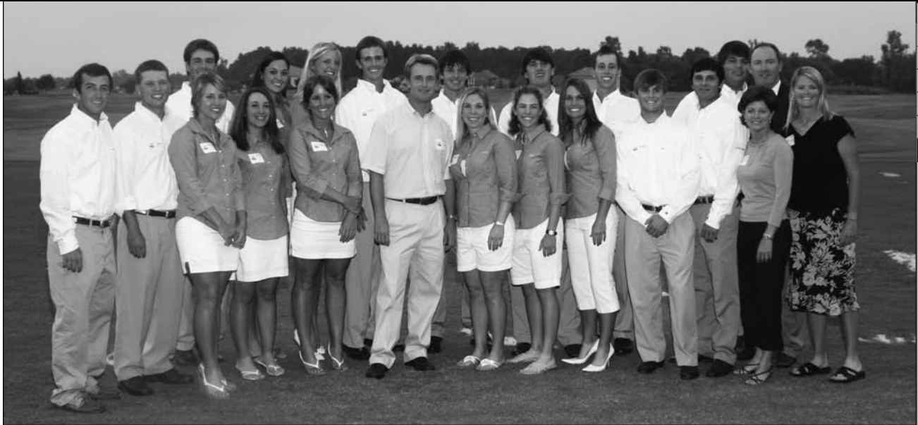
Above: The men's and women's golf teams with former LSU golfer David Toms.