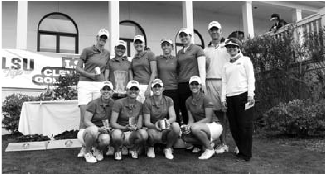
2005 LSU/Cleveland Golf Classic Champions

T op-ranked Duke proved to be the best in the 2007 LSU/Cleveland Golf Classic, besting the strongest and largest field in an LSU women's hosted event in program history. The Blue Devils, who would return to Baton Rouge to set several course records in May in the NCAA East Regional, posted an eight-over score of 872 to win by six strokes over Vanderbilt and seven over Auburn. LSU finished eighth in the star-studded field at 42-over 906.