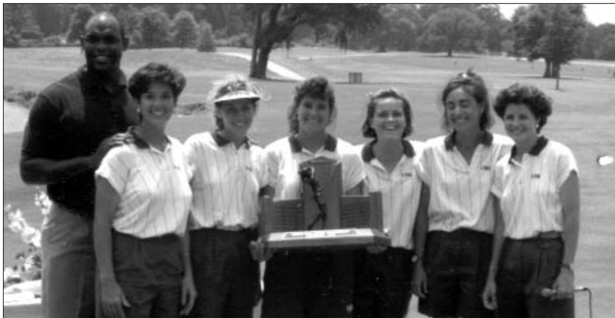
1991-1992, SEC Champions