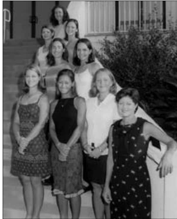
2000-01, 12th Place NCAA Championships