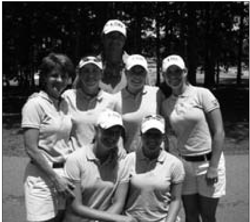
2006 Lady Tigers after finishing second at the NCAA East Regional.

For more information or to receive an application form, contact: TAF/LSU Golf, P. O. Box 711, Baton Rouge, LA 70821.