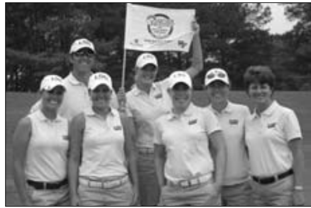
2006 NCAA Regional Second Place Team