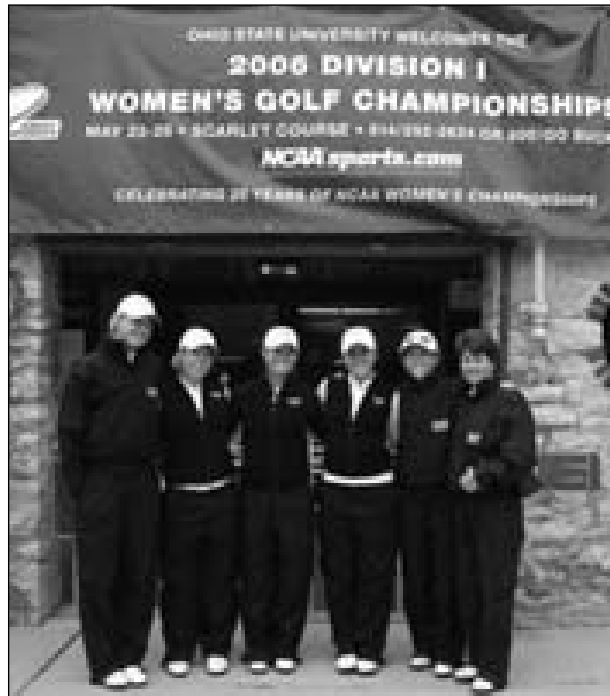
The Lady Tigers in front of Scarlet Course Clubhouse.