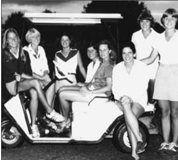
1979-1980, LSU's First Women's Golf Team