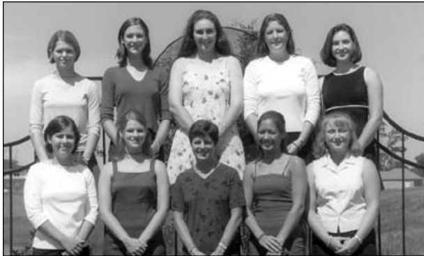
1999-2000, 10th Place NCAA Championships