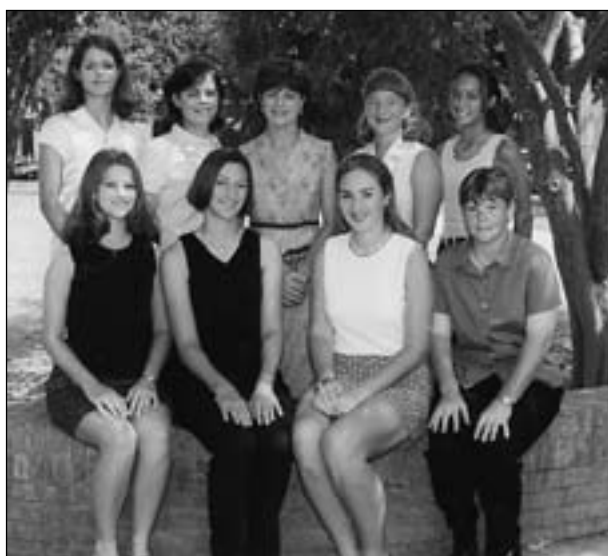
1998-1999, 10th Place NCAA Championships