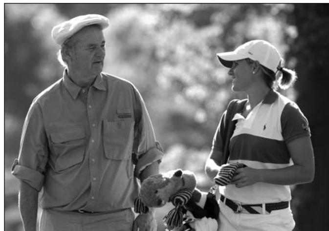
Right: Members of the women's golf team caddied for celebrity Bill Murray at the PGA event in New Orleans.

The LSU golf teams have become known not only for their playing ability but for their appearances in the community reaching out as part of the CHAMPS program, taking part in golf events such as the PGA Tour stop in New Orleans, or keeping alums involved in the program through events such as an alumni weekend during football season.