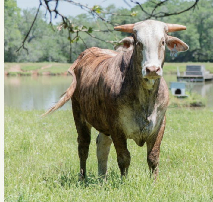
Augustus Ranch, Yoakum, TX

Solution: The district accommodated smaller delivery volumes on a more frequent basis as the product became available. The Common Market would facilitate monthly pick-ups and deliveries to the schools.