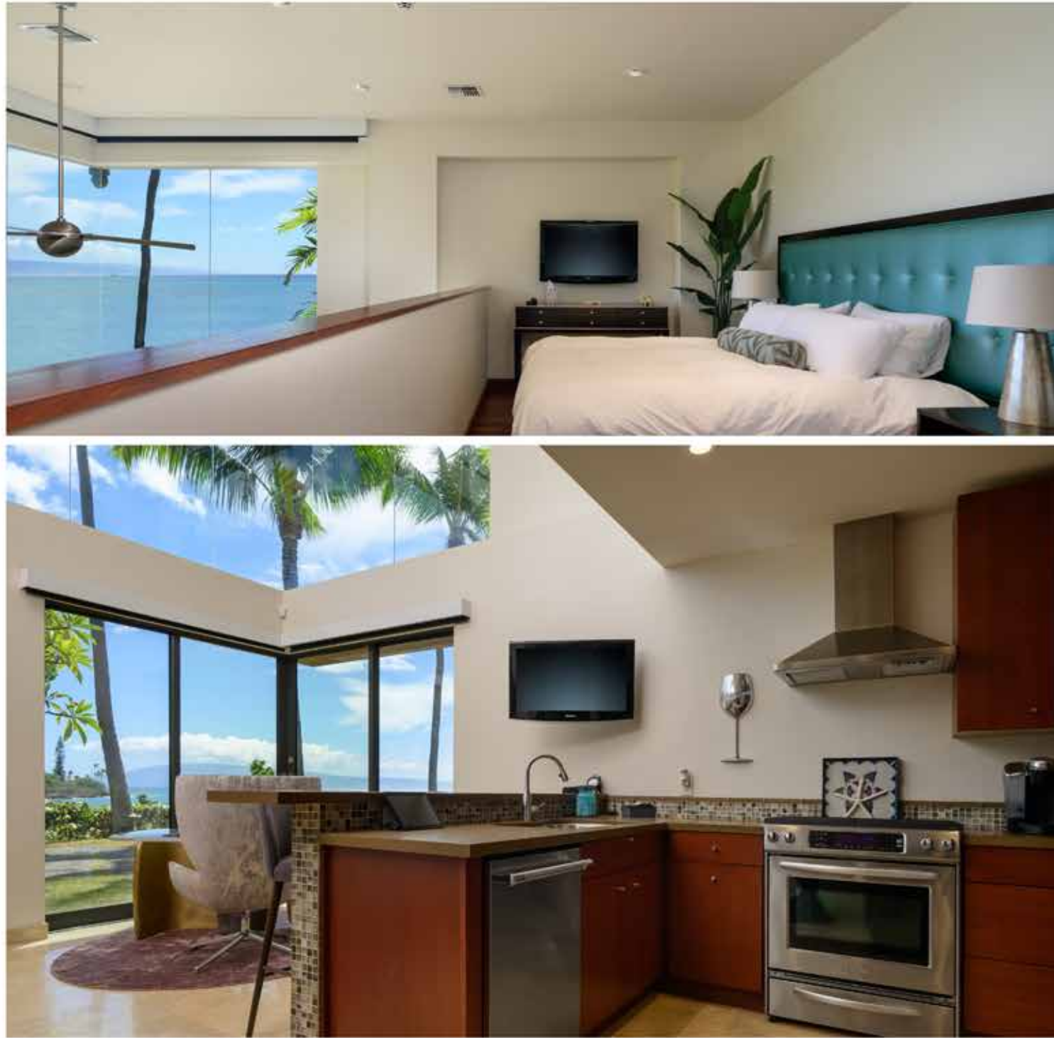
An attached oceanfront one-bedroom Ohana can be utilized as a private office, for guests, or a caretaker.