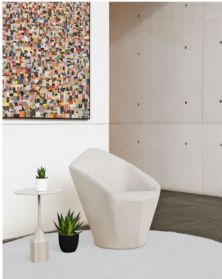
On the left, featuring Penta armchair with Burin Mini. On the right Penta armchair with Tiers low table