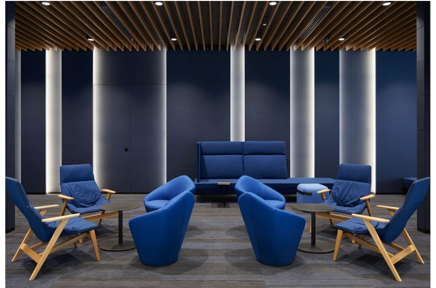
Project on the left: Teulada Moraira Concert Hall