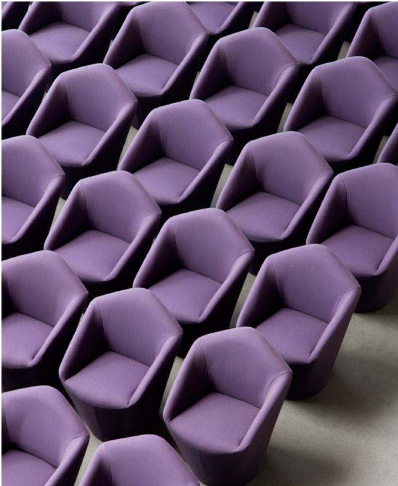
Composition of Penta lounge chairs in purple fabrics