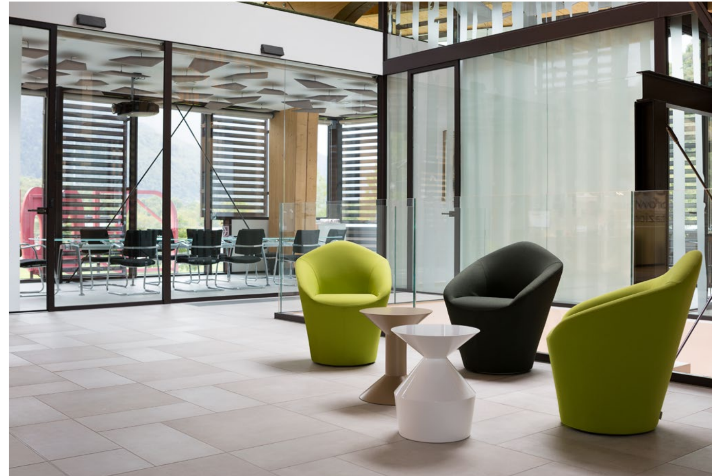
Project: Cotonella Offices, Italy. Architecture: J+S Architecture & Engineering. Interior Design: FASEMODUS + Studio Al Milano