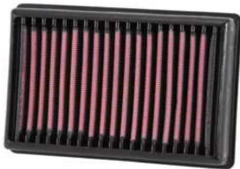
BM-1113 for the 2013 to 2014 BMW R1200GS, as well as 2014 R1200GS Adventure, and R1200RT is designed to increase airflow without sacrificing engine protection

The new R1200GS and R1200GS Adventure series of motorcycles from BMW Motorrad can trace its roots back to 1980 when BMW introduced the R80GS. GS is an abbreviation for the German words Gelände/Straße, which can be translated to off-road/road in English. The BMW Motorrad GS line of motorcycles ultimately created the Adventure Touring segment of motorcycling and is immortalized by the popular documentary Long Way Down which follows Ewan McGregor and fellow actor Charley Boorman as they journey around the world on R1150GS Adventure bikes.