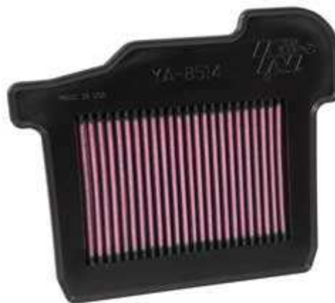
K&N high-flow air filter number YA-8514 is engineered to increase airflow while also fitting inside the stock air filter box of 2014 Yamaha inline triple MT-09 & FZ-09 models

Perhaps more exciting than the increased performance that comes with a K&N high-flow air filter is that they are also a washable and reusable air filter. The ability to wash and reuse a K&N air filter means that it will pay for itself over