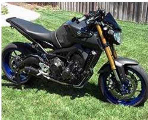
The 2014 MT-09, or FZ-09 in the U.S., uses the first Yamaha inline triple since Yamaha XS750 and Yamaha XS850 models were manufactured from 1976 to 1981

The Yamaha MT-09, or FZ-09 as it is called in the United States, is a significant new model in the Yamaha Motor Company's vehicle line up. Yamaha product manager Shun Miyazawa said motorcycle buyers are moving away from supersport motorcycles and trending toward naked street fighter type bikes. Perhaps the most direct competition to the 2014 Yamaha MT-09 & FZ-09 model is the Triumph Street Triple. Similar to the Triumph Street Triple, the 2014 Yamaha MT-09/FZ-09 is powered by a liquid cooled 847cc inline triple cylinder engine. An inline triple engine has a unique combination of power, torque, and low-weight in comparison to other engine configurations. Yamaha has not produced an inline triple since the Yamaha XS750 and Yamaha XS850 motorcycles of the late 1970's and early 1980's.