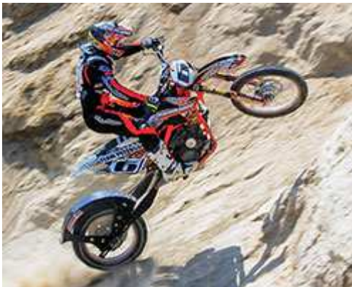
Team Peterson uses a KTM 950 engine in their hill climb bike proving the objective at KTM for its first twin-cylinder engine to be light, compact, and versatile was successful

made these detailed airflow and dust retention test results available for viewing.