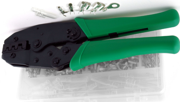
Use a Trail Tech Crimp Kit for a Professional Installation. P/N: HT230C