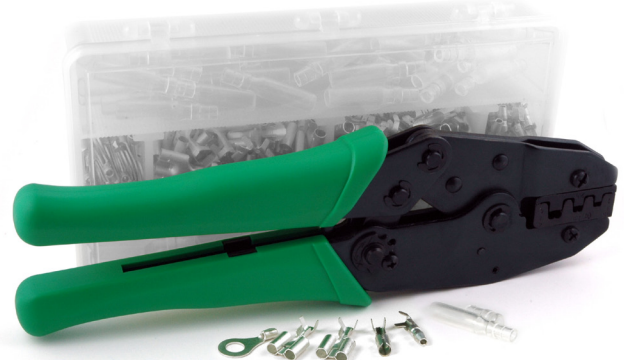
Use a Trail Tech Crimp Kit for a Professional Installation. P/N: HT230C