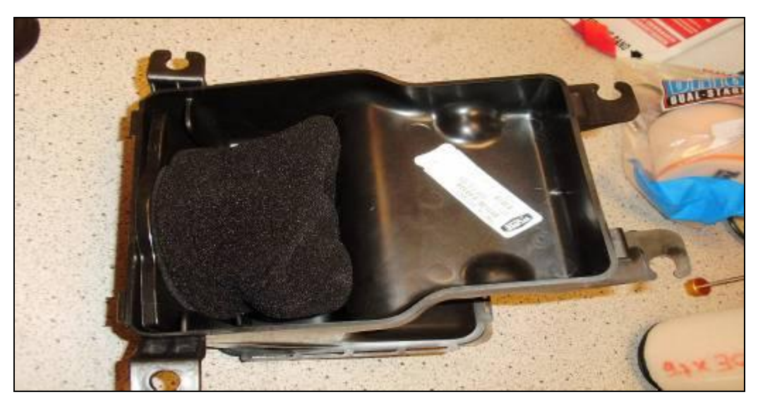
(With all stock components removed, ready for Twin Air installation)

Unbolt the stock filter cage. Slid the filter cage out of the airbox. Remove the stock airboot from the airbox.