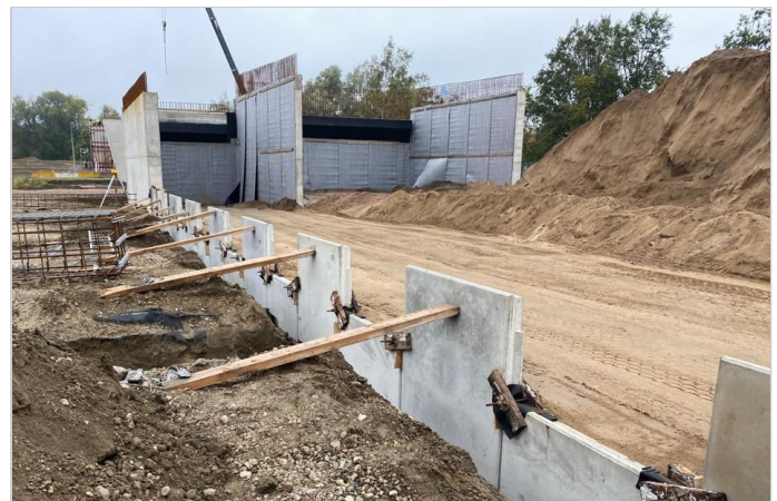
Construction phase: first layer of Macres panels