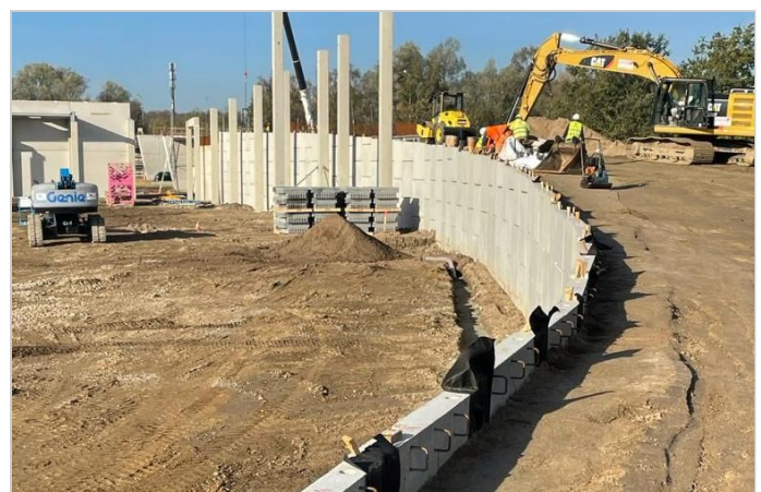
Construction phase: last layer of top cut panels had been positioned