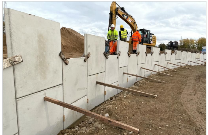
Construction phase: panels installation