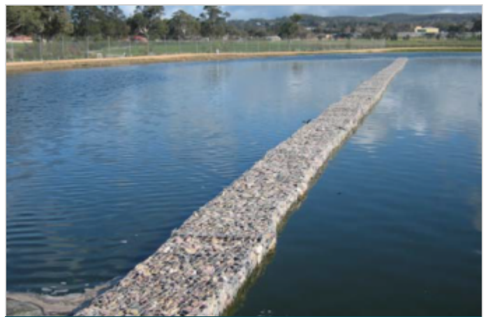
4 months after completion