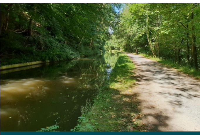
The Monmouthshire and Brecon Canal