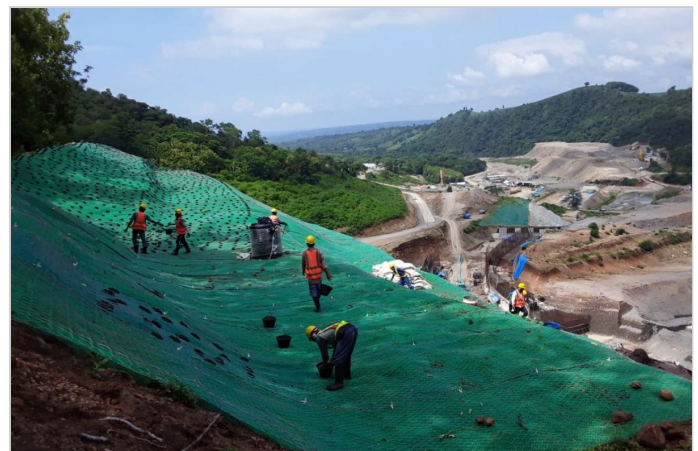
Mulching process on MacMat® HS