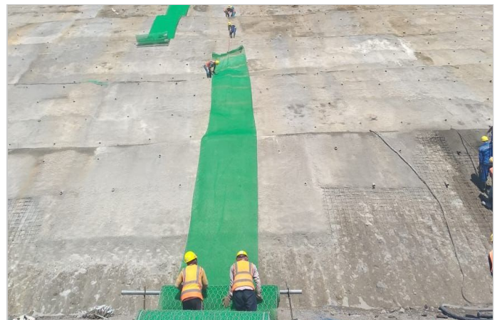
Installation of MacMat® HS