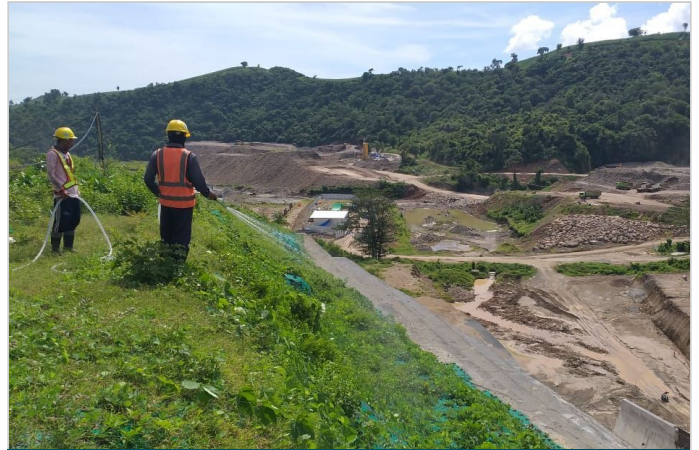
Maintenance Process - Watering