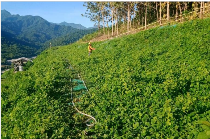
Lush Grown Vegetation