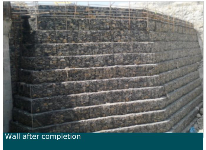
Wall after completion