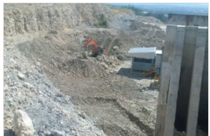
Site condition before the construction