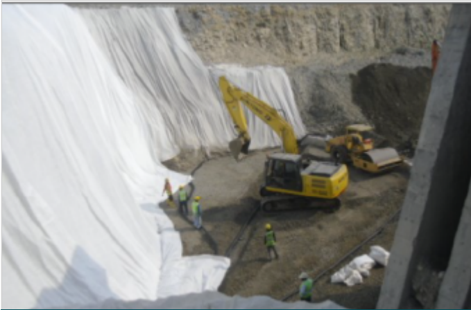
Installation of the filtering geotextile for the drainage system