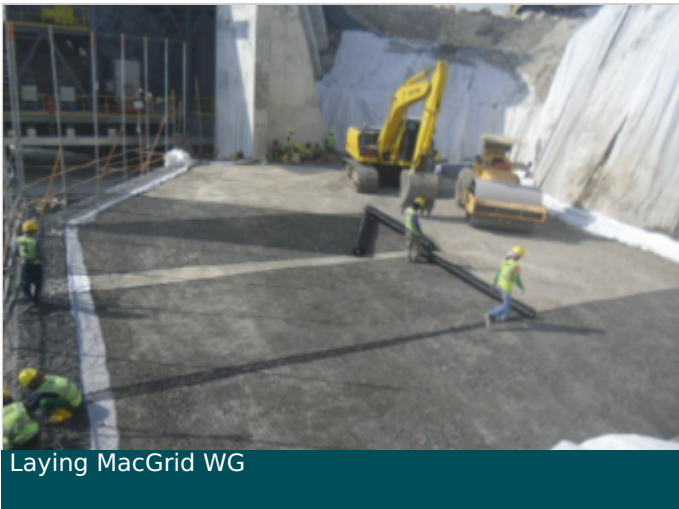
Laying MacGrid WG