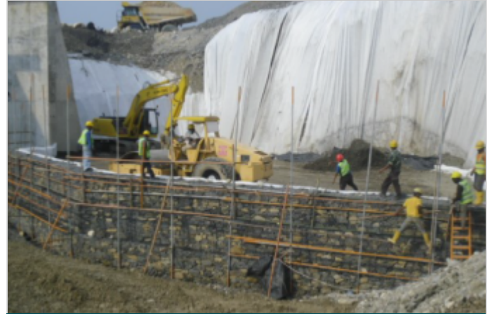
Terramesh System installation