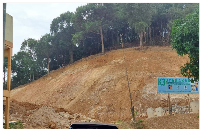
Slope condition before installation (warehouse area)