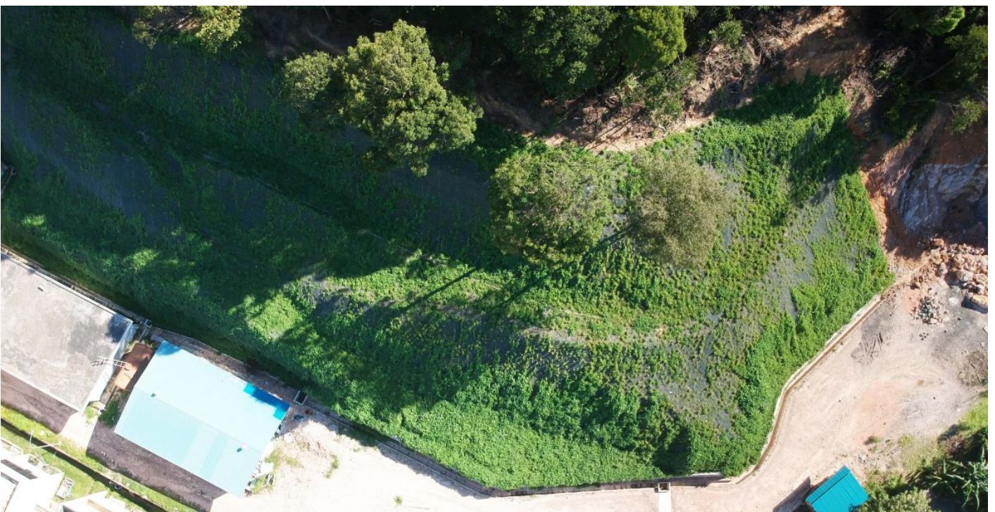
Lush grown vegetation (warehouse area)