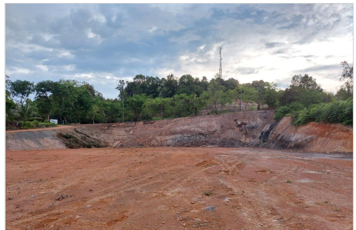
Slope condition before installation (parking lot area)