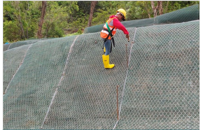
Installation of MacMat® HS