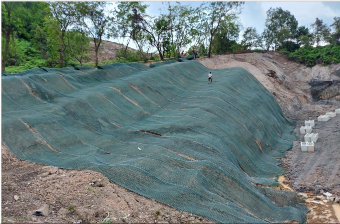
Installation of MacMat® HS