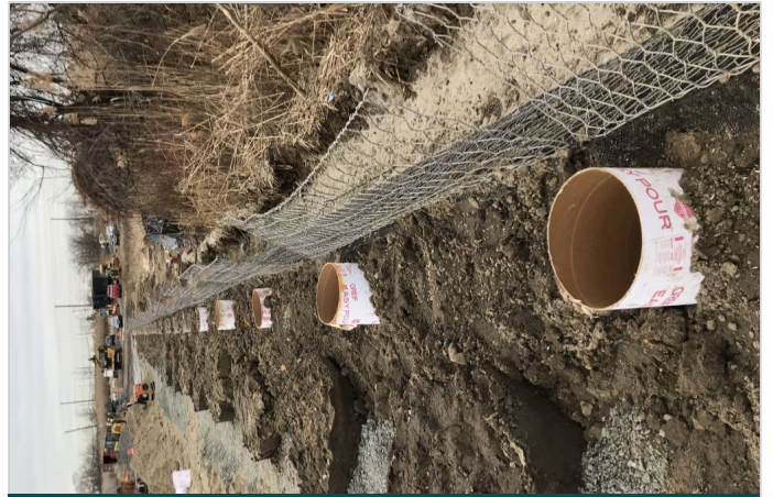
Green TerraMesh filled with soil. Note: the sonotubes are for fenceposts