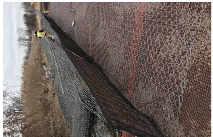
Start of installation