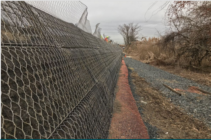
Additional courses added