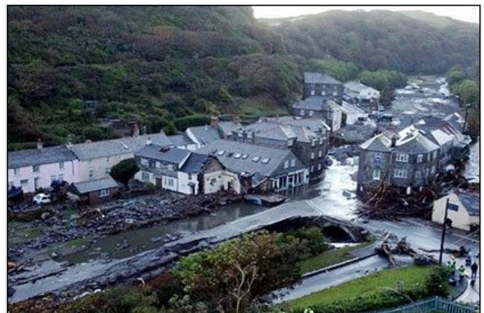
Dramatic floods in Boscastle, August 2004