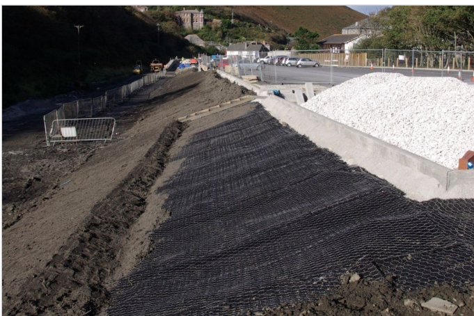
MacMat-R lids, prior to being covered in top soil