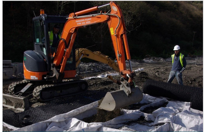
Filling the Reno Mattresses with site won material