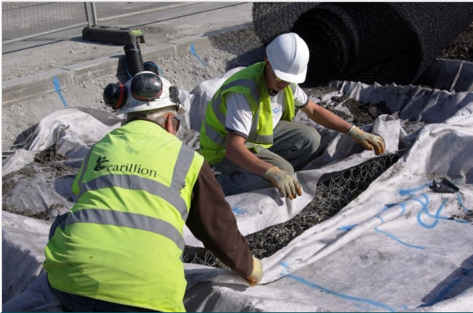
Adding the Bidim filter fabric lining to the Reno Mattresses