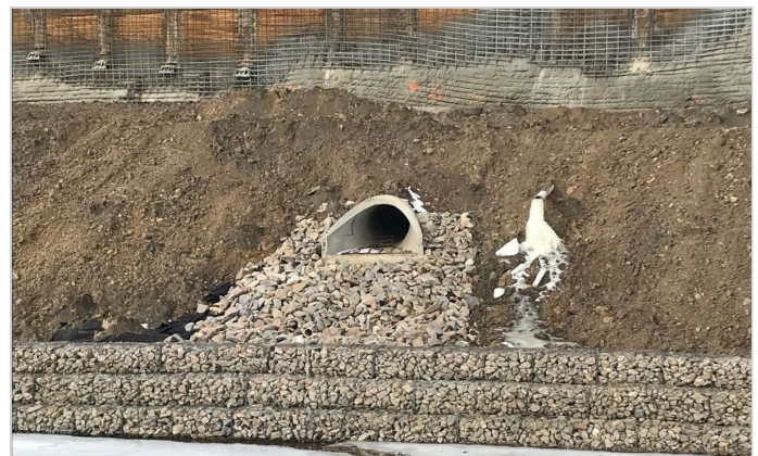
Wall construction & slope drain