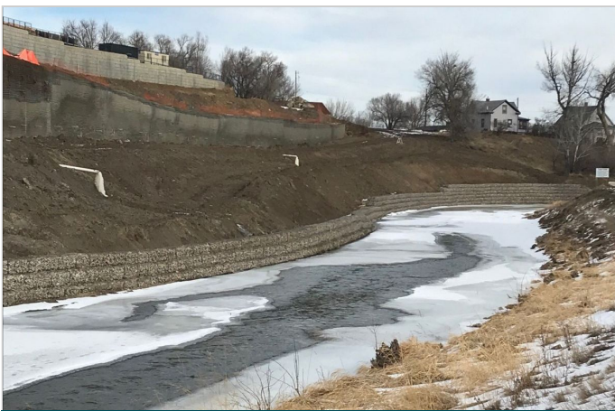
Final gabion & soil nail wall