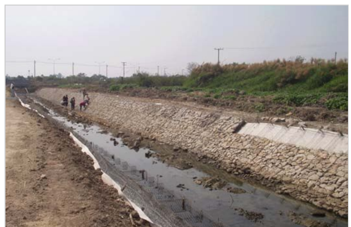
Reno Mattress installation (2)