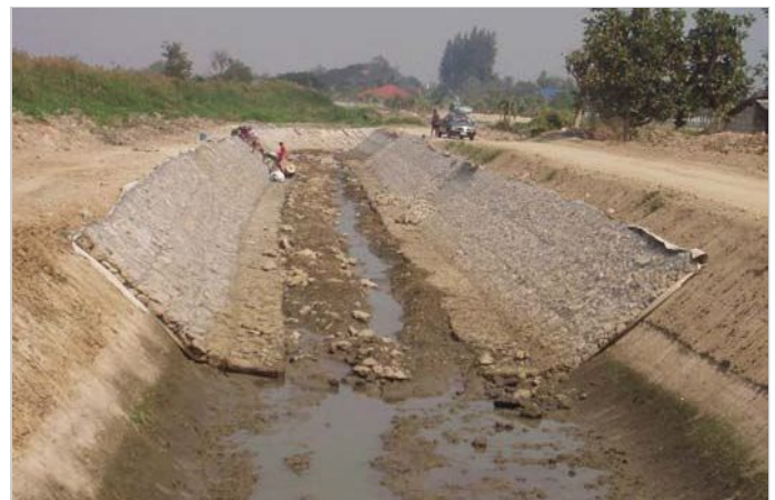
Reno Mattress installation (1)