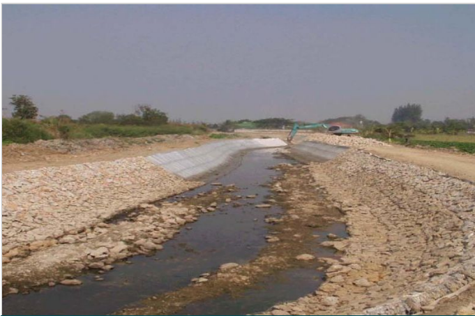
Reno Mattress installation (3)