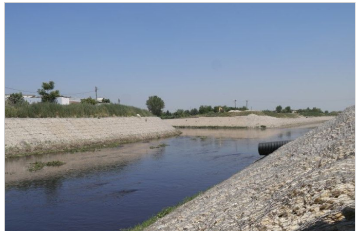
After The Application