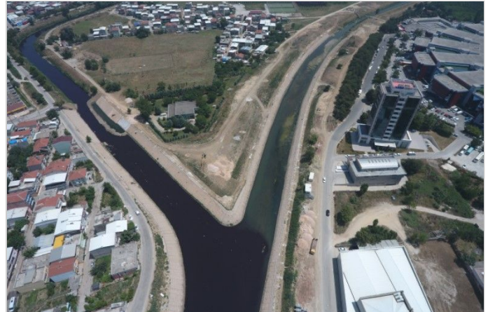
After The Application