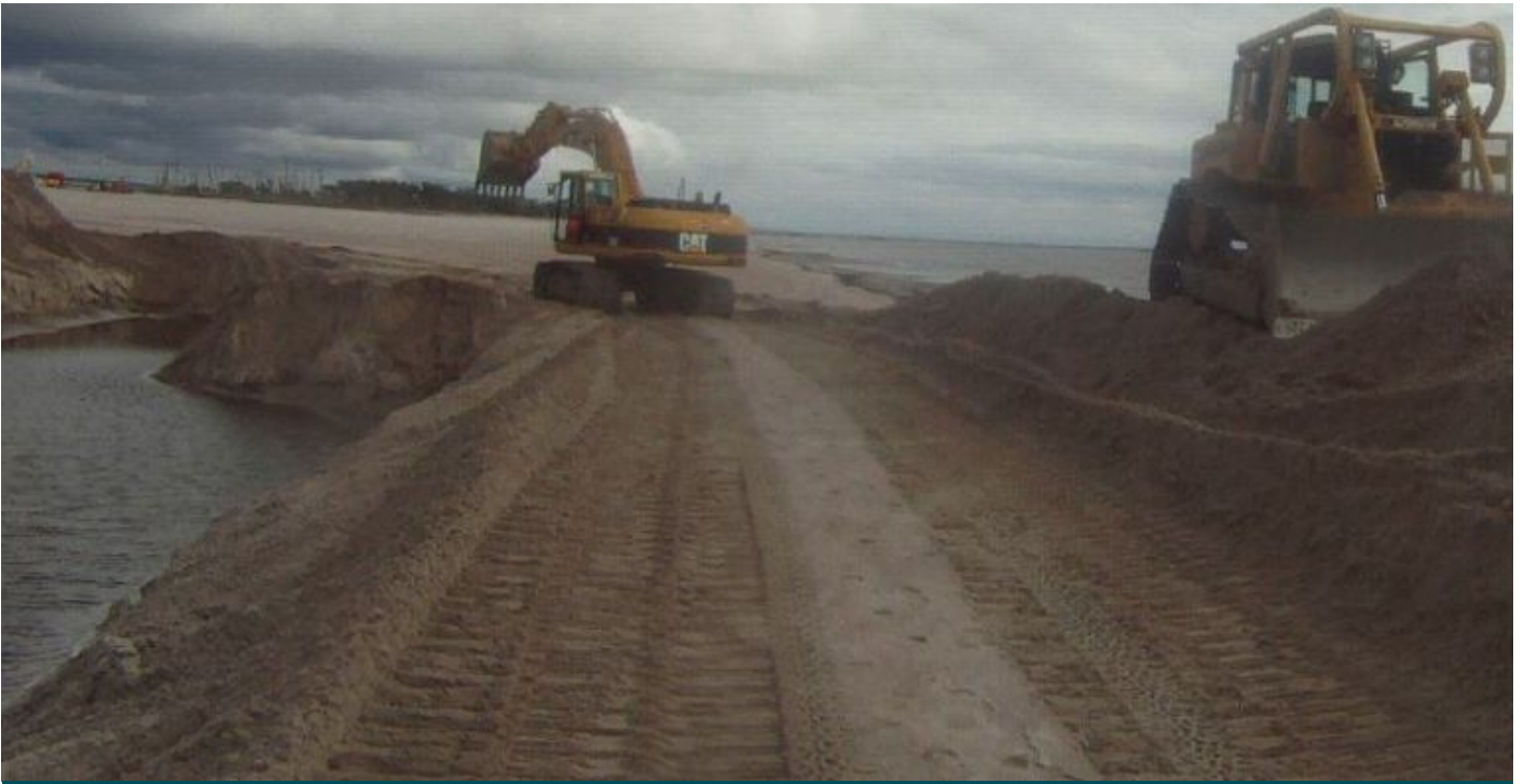
Final beach fill coverage over Mature/Mansour, to surface level