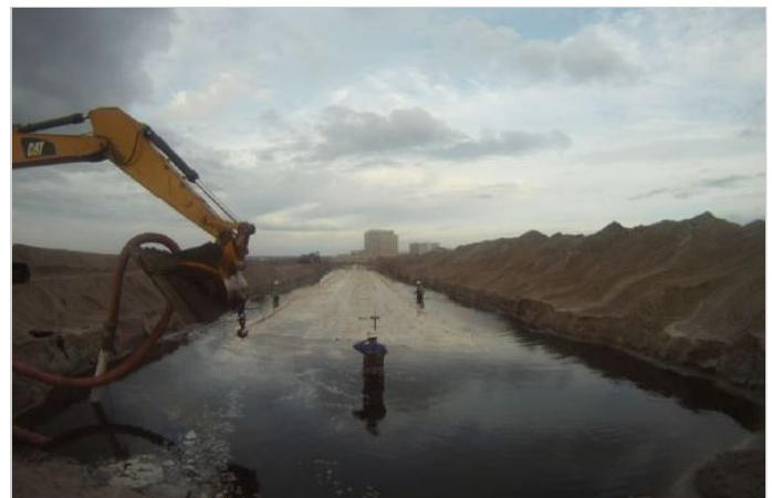
Aligning Mansour and Mature placement