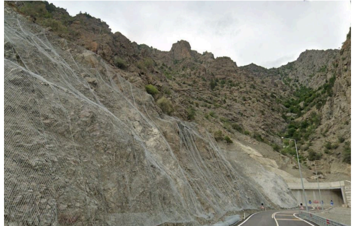
During the construction