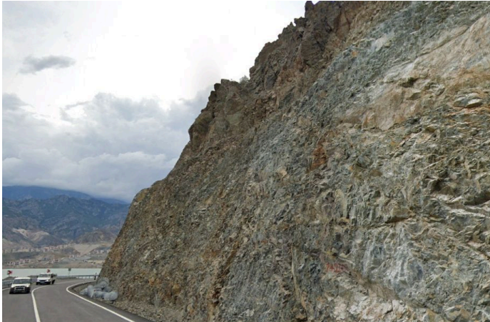
Steep slope outcrop view before drapery system