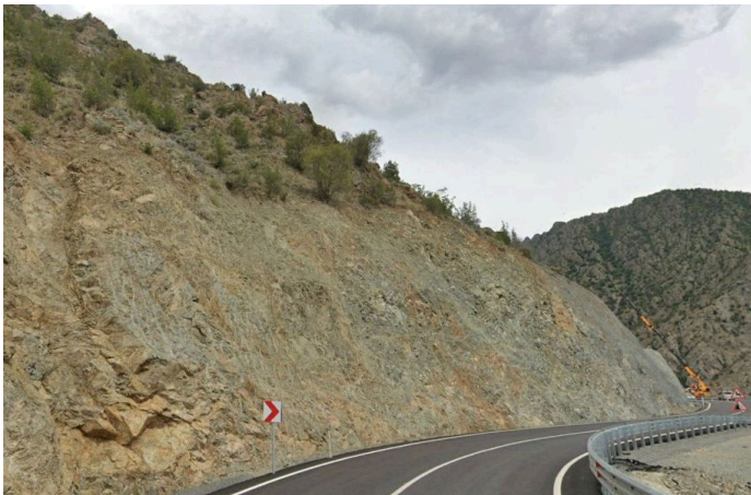
During the construction

The application of the Drapery (Passive) System not only addressed immediate safety concerns but also provided a solution to the ongoing risk of rockfalls, preventing potential hazards from affecting the road and surrounding infrastructure.