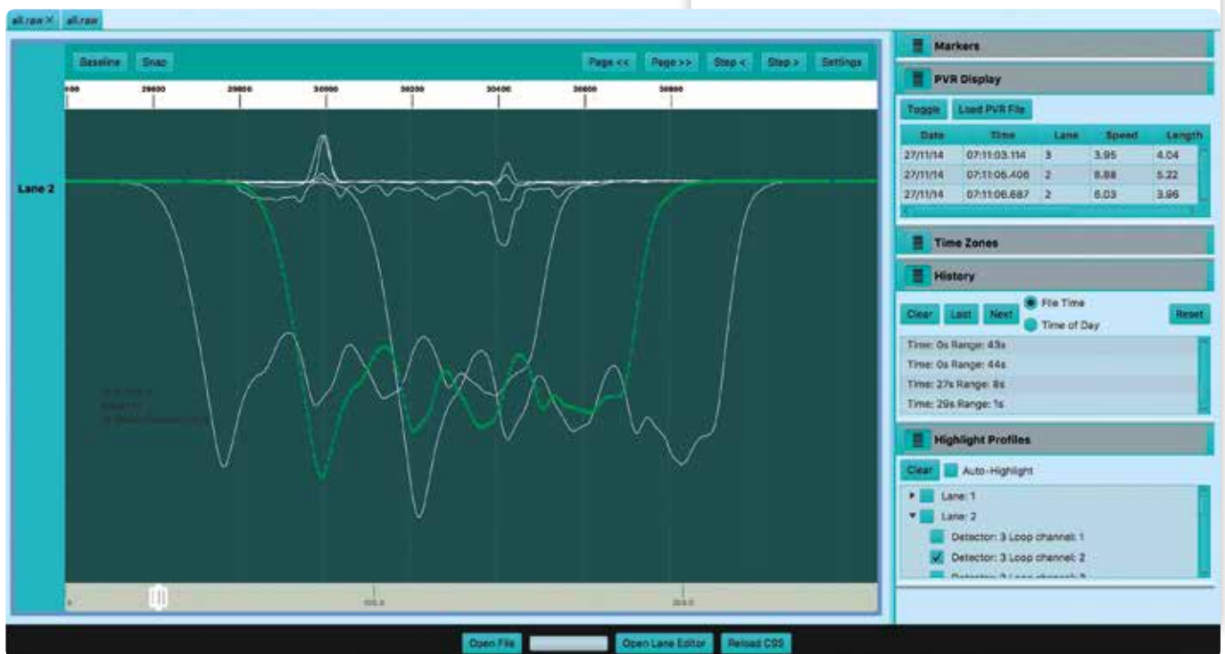
ABOVE: Quantum Vision in operation

Once installed Quantum Vision is easy and intuitive to use providing clear and precise data analysis whether the requirement is to view data in real-time or from pre-recorded packets.