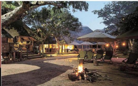
The Tembe lodge offers luxurious accommodation in a secluded magical setting.

visible to any of the others. In the distant past, this area was beneath the sea, Vusi explained.