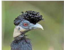
Crested guinea fowl made a regular appearance at the Tembe campsite.

warthog; and a distant giraffe. Then we experienced a heart-stopping moment. The usual bone-shaking bounce of the game vehicle suddenly stopped and from down the road the immense bulk of an elephant approached. It lumbered towards us at a leisurely pace, though these African giants can reach speeds of up to 10km/h.