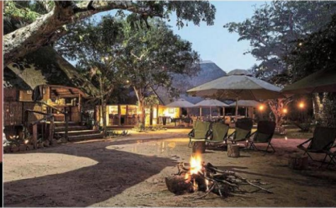
The Tembe lodge offers luxurious accommodation in a secluded magical setting.

visible to any of the others. In the distant past, this area was beneath the sea, Vusi explained.