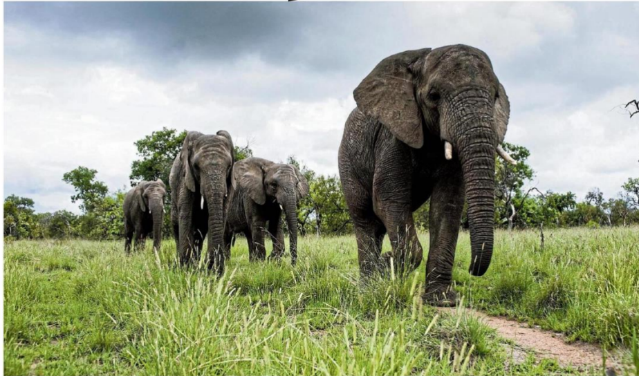
Elephants are thriving in Maputaland.