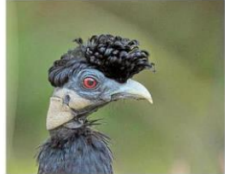
Crested guinea fowl made a regular appearance at the Tembe campsite.

warthog; and a distant giraffe. Then we experienced a heart-stopping moment. The usual bone-shaking bounce of the game vehicle suddenly stopped and from down the road the immense bulk of an elephant approached. It lumbered towards us at a leisurely pace, though these African giants can reach speeds of up to 10km/h.