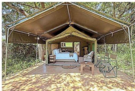
Glamping, Tembe-style. Beauty in nature.

Over time, their population has burgeoned in this peaceful paradise. Some elephants migrated east, away from encroaching civilisation in Natal, while others came south from Delagoa Bay, to escape the bullets and gunfire of the war in Mozambique. The Tembe elephants are