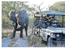
An elephant saunters past a game vehicle.

On our first game drive, we saw abundant antelope, impala and nyala;