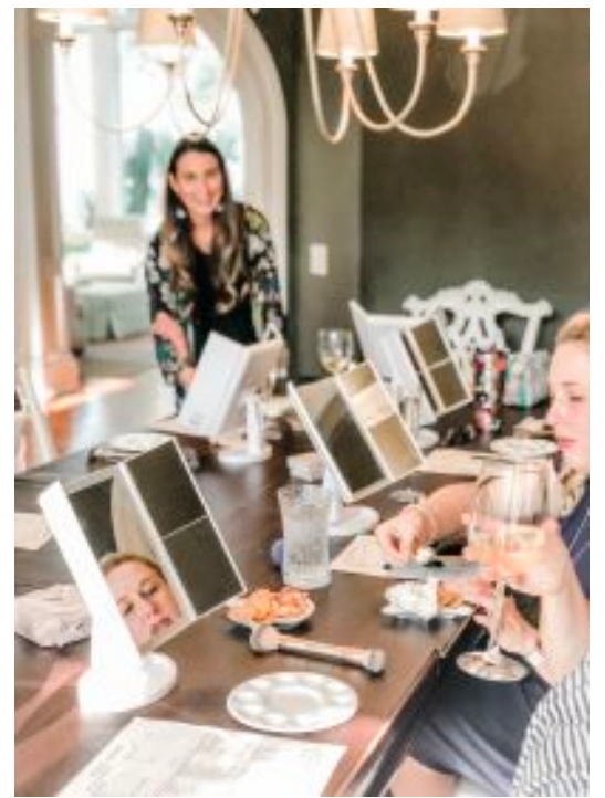
Makeup Demo Stations!