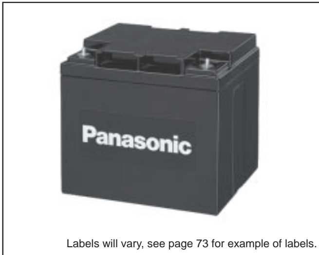
Labels will vary, see page 73 for example of labels.

(a) The photo and dimensions represent LC-X1224AP