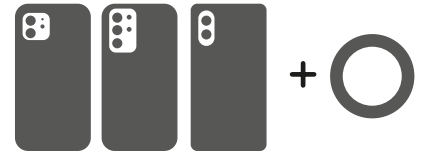
Smartphone with metal ring