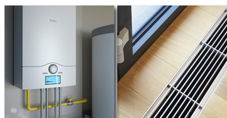
Water heater automation