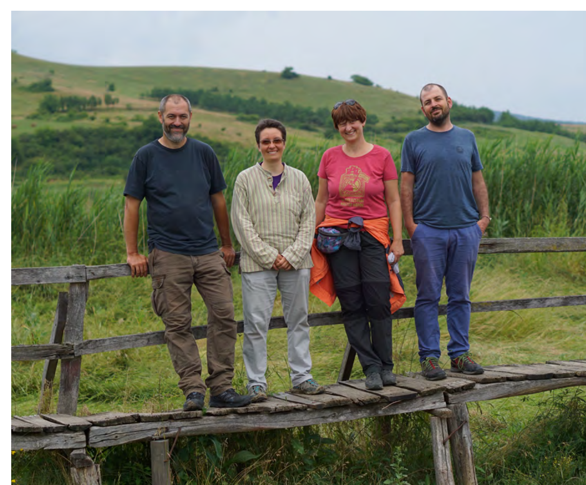
Átlátszó Erdély Team

Átlátszó Erdély came to the Startups Lab focused on improving one of their most important revenue streams: donations. While a majority of their funds come from grants, the team aimed to reduce their dependence on this income. They wanted their community to play a bigger role in sustainably funding the company.