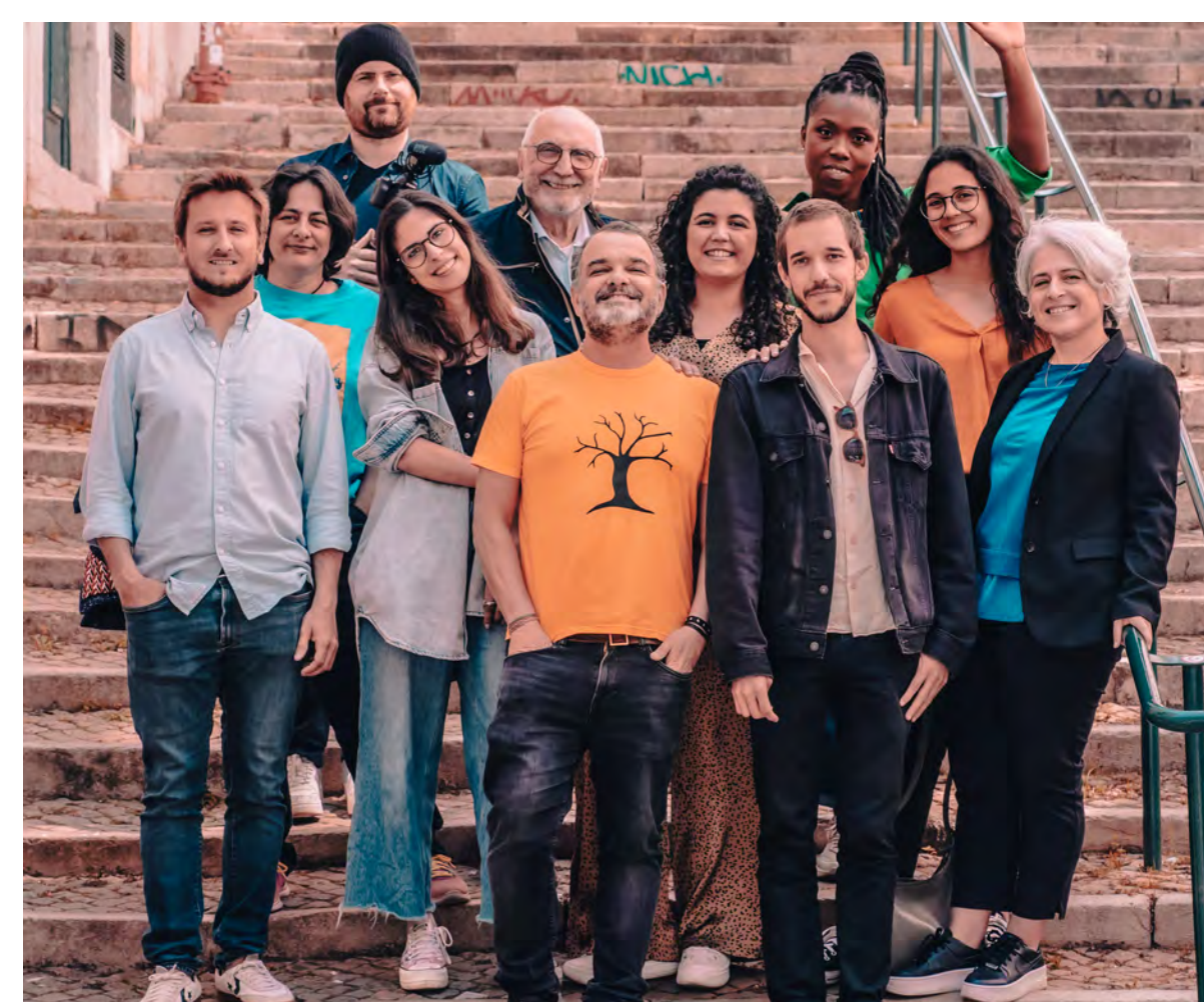
Mensagem Founding Team

The concept of building a community around a brand is a quite literal mission for Mensagem. It comes as no surprise that building, maintaining and monetizing this community was one of the core challenges the team wanted to work on in the Startups Lab. That happened digitally, through experiments aimed at increasing conversion, but also physically through the production of merchandise and the plan to start pop-up-residencies in different areas of Lisbon.