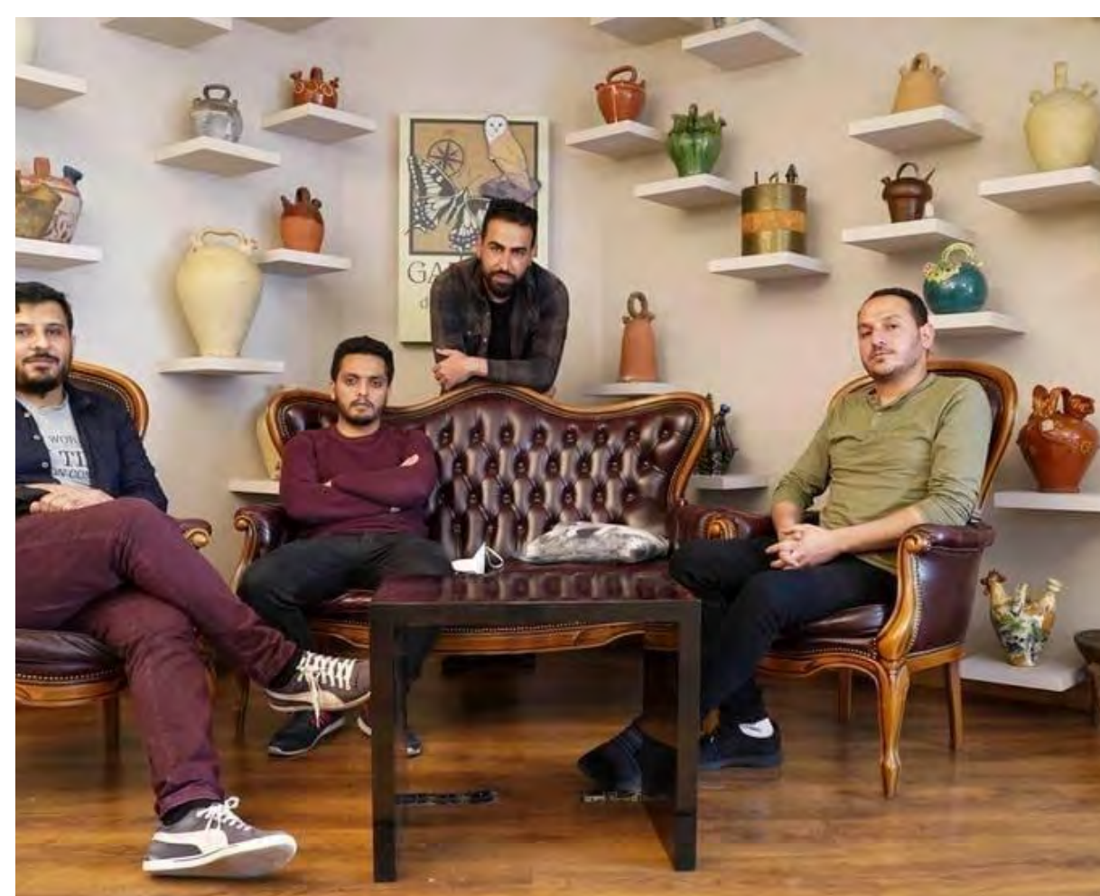
Baynana Founding Team

For Baynana, a huge part of the GNI Startups Lab was exploring new reader revenue streams. To that end, the team tried a host of different steps — from validating and launching a newsletter to experimenting with new content formats like video on YouTube. They implemented a new social strategy focussed on attracting reader revenue, and changed their entire communication towards a membership model.