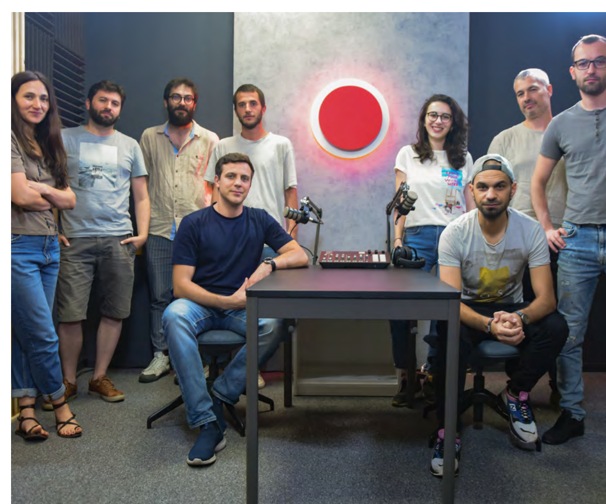
Recorder Founding Team

Recorder set out in the GNI Startups Lab on a quest to better understand their readers, supporters and content. Metrics and measurement were a big part of this strategy. The team experimented with different tools to better track information from their audience, identify reasons for churn and make informed decisions about their monetisation strategy on YouTube (for example, whether to guide their users towards a YouTube Membership or Patreon). After many tests, they decided to use BareMetrics as their new tracking tool and incorporated it into their workflow.