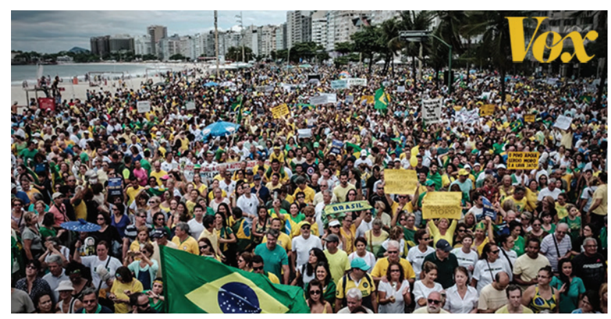
Vox Atlas S1-E13: The biggest corruption scandal in Latin America's history

The best example is a story I did about Brazil's Car Wash scandal, a massive corruption scheme where governments colluded with oil and construction companies to inflate Latin American infrastructure project prices and embezzle huge amounts of public money. When the scheme was uncovered, it shut down dozens of enormous projects all over Latin America, and thousands of people were laid off.