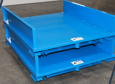
Collapse to nest up to six units high (two shown).