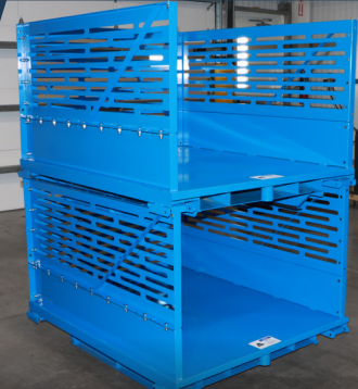
Stack two assembled units during storage.*