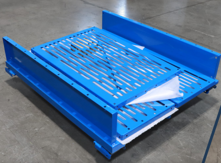
Ships knocked down flat to save on freight costs.