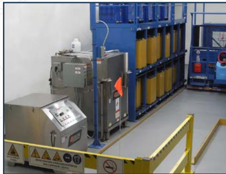
RNS-4 &amp; BWC-2