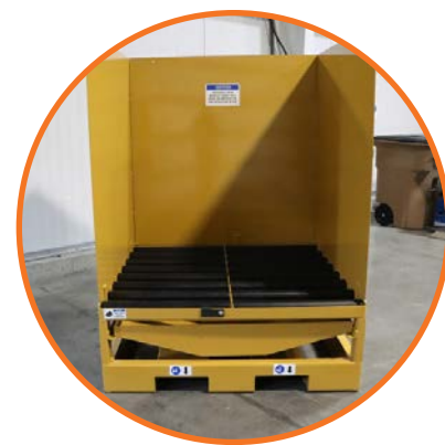
RWS-3 with Fork Pocket option