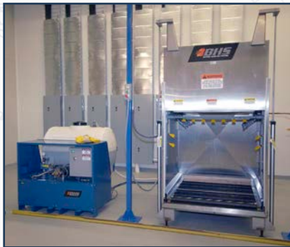
RNS-1 &amp; BWC-2

Use a Recirculation/Neutralization System (RNS) in conjunction with your Battery Wash Equipment in order to create a closed loop system where battery wash water is contained, neutralized, and recirculated for reuse by the battery wash equipment.