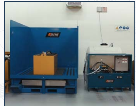
MWS-72 &amp; RNS-1