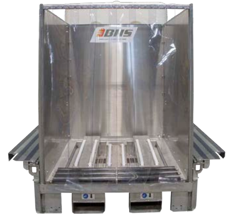
Side Steps fold down