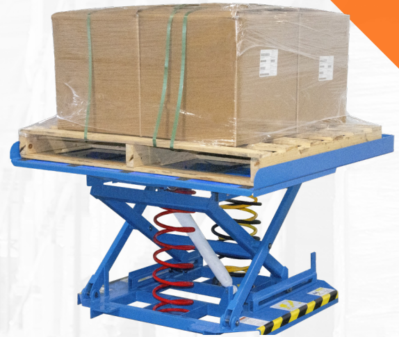
Square tabletop matches standard sized pallet dimensions

Anti-Skid Traction Tape eliminates slippery platforms for added safety