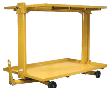
TT-QS-4872-2TIER-ADJ with Optional Angled Shelf