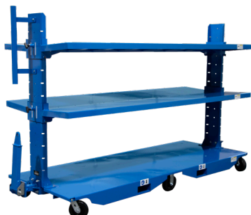
TT-CS-3696-3TIER-ADJ with Options: Angled Shelves, No Lip, Handle, Fork Pockets, and Blue Powder Coat