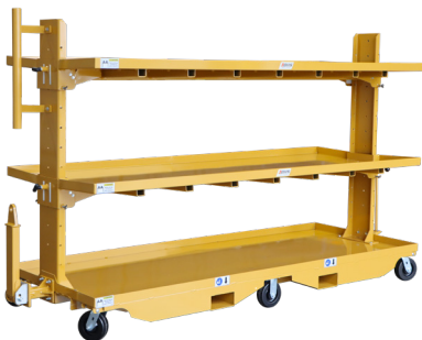
TT-CS-3696-3TIER-ADJ with Options: Angled Shelves, Handle, Fork Pockets, and Ergonomic Drop Pin Hitch