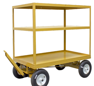
TT-QS-3660-3TIER with Bolt-On Shelves and custom pneumatic tires