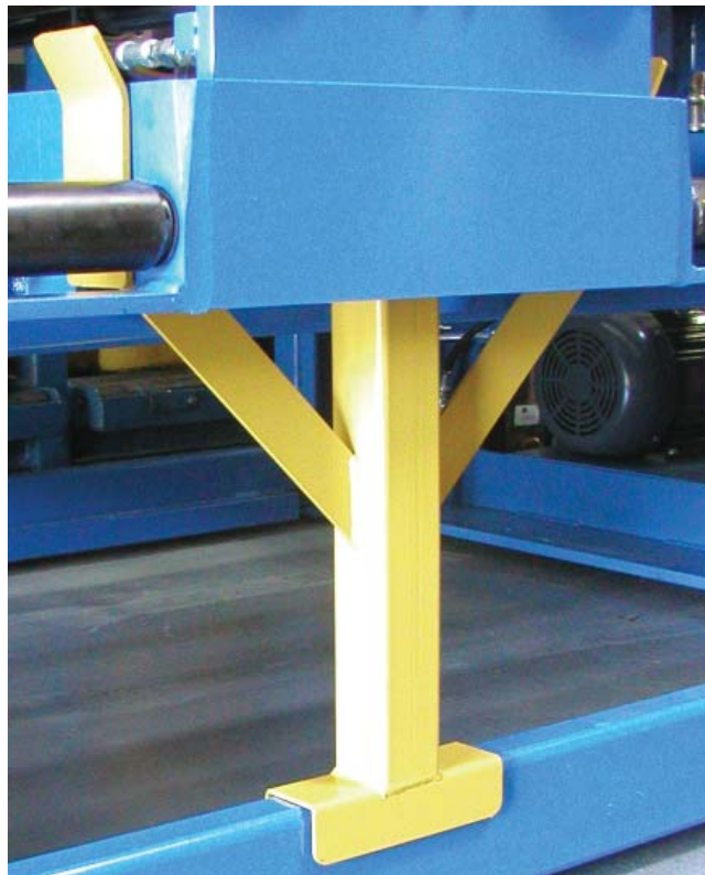
SINGLE LEVEL SERVICE STAND PROPERLY INSTALLED