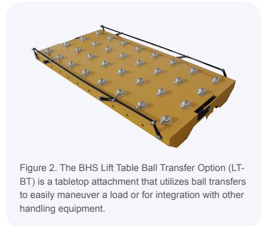
Figure 2. The BHS Lift Table Ball Transfer Option (LT-BT) is a tabletop attachment that utilizes ball transfers to easily maneuver a load or for integration with other handling equipment.

Dual scissor legs provide even more range of height, and are indispensable in transferring loads on the dock or mezzanines up to 6 feet off the ground level. BHS Powered Mobile Lift Tables allow workers to move loads of over a thousand pounds onto and off of these elevated work areas, significantly reducing risk of injury.