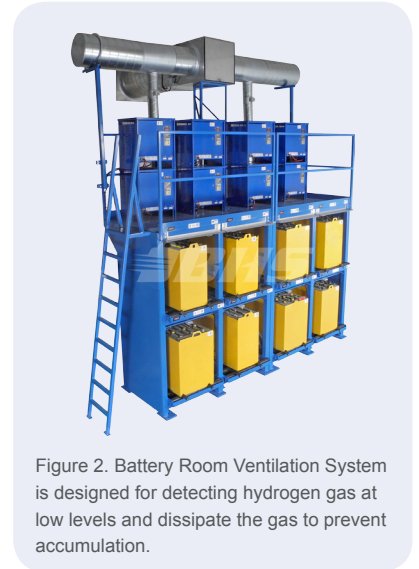
Figure 2. Battery Room Ventilation System is designed for detecting hydrogen gas at low levels and dissipate the gas to prevent accumulation.

" Regulatory Guide 1.128 - Installation Design and Installation of Vented Lead-Acid Storage Batteries for Nuclear Power Plants ." NRC. U.S. Nuclear Regulatory Commission, Feb. 2007. PDF. 28 Nov. 2017.