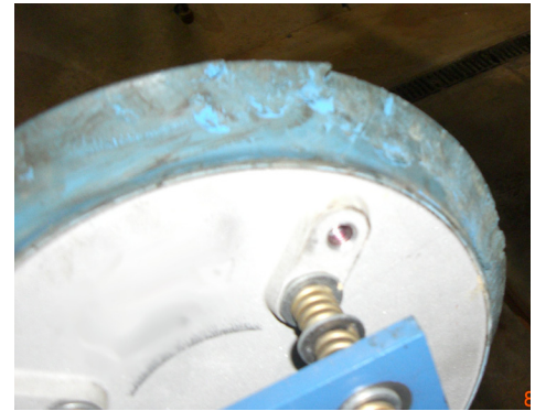
Vacuum cup damage due to elevation adjustment after attachment to battery

Send your suggestions to service@bhs1.com with “Tech Tip” in the subject line and let us know.