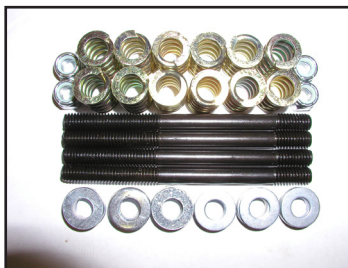
Hardware kits contain all hardware required for mounting one vacuum cup HW-KIT-2 (BE units) shown

BHS offers two hardware kits. The HW-KIT-1 for Automatic Transfer Carriage (ATC) units with vacuum extraction contains (4) 4" studs and (8) springs along with the required nuts and washers for installation. The HW-KIT-2 for Operator Aboard Battery Extractor (BE) units with vacuum extraction contains (4) 5" studs and (12) springs as well as required nuts and washers. Proper installation of either kit requires that the studs be tightened securely into the vacuum cup or adapter plate (10" cups only). See photos below for proper installation of washers and springs. The nuts should then be installed and tightened until the springs are just tight enough that they cannot be moved by hand. The nuts on the lower studs should then be tightened additionally to supply a 1/4" forward pitch to the vacuum cup.