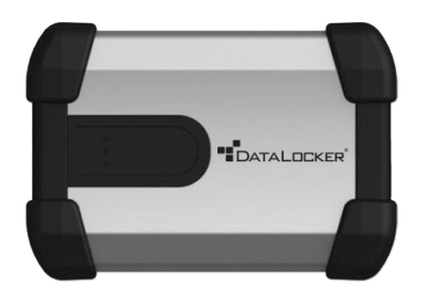
Figure 1: DataLocker H100

This guide is designed to help you set up your DataLocker H100 device with minimal effort.