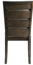
Slat Back Side Chair