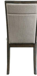
Fabric Back Side Chair