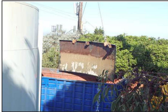
April 17, 2014 - Tank Shell Panel Removal and Disposal