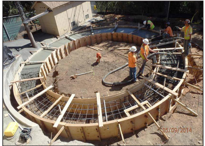
May 9, 2014 - South Tank Concrete Beam Pour