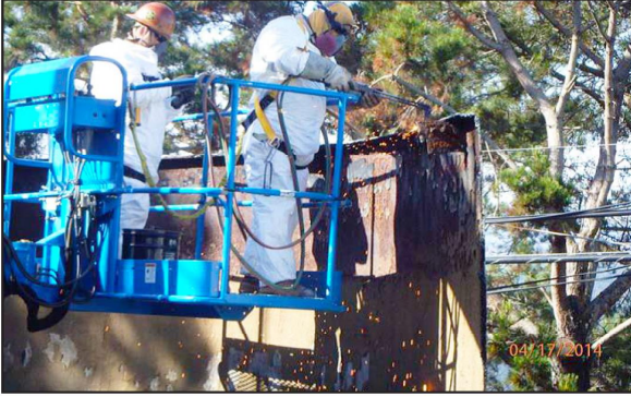
April 17, 2014 - Tank Shell Torch Cutting