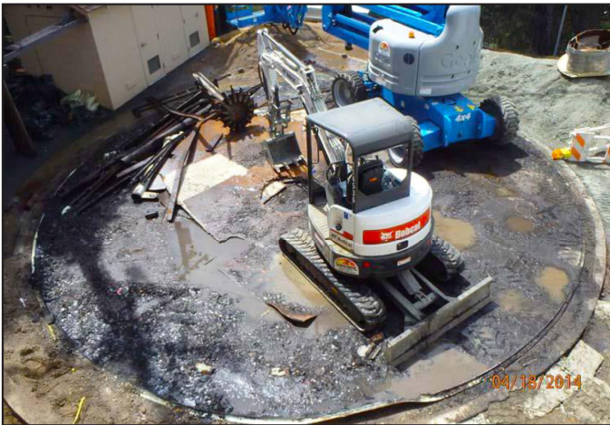
April 18, 2014 - South Tank Shell Demolition Completed