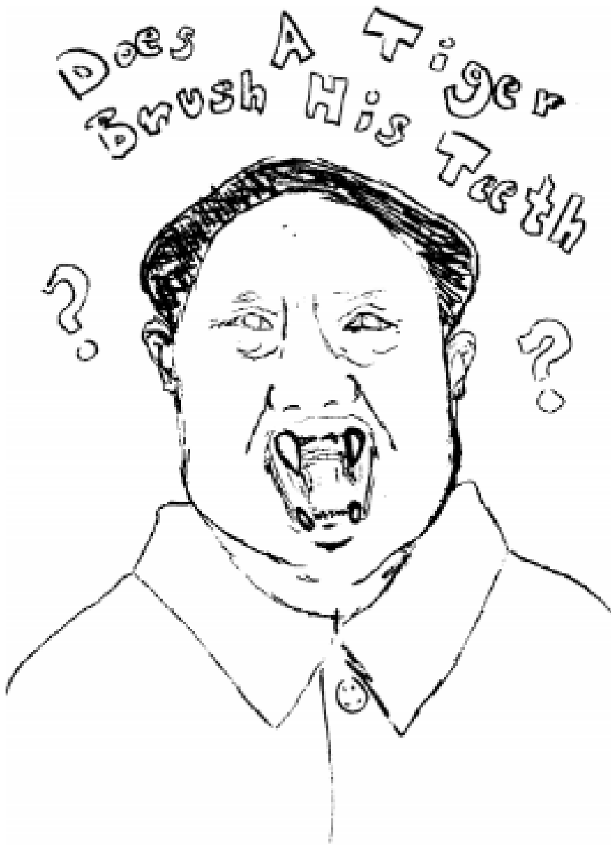
Untitled (cover) Ashley McCrea Photograph