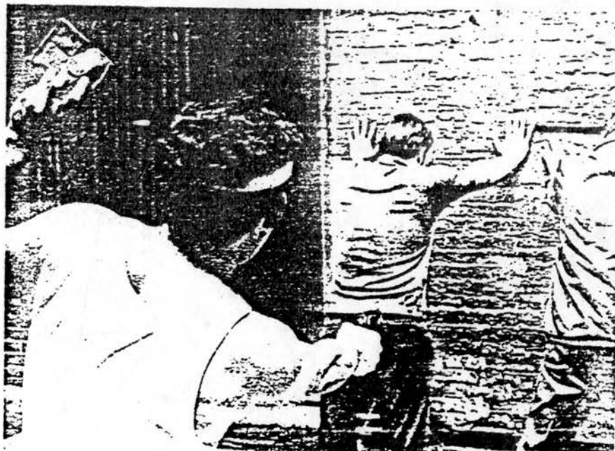
Headbands (different colors for different days) help alert uniformed officers to the identity of a policeman making apprehension clad in casual attire.

Portable radios are a valuable asset to law enforcement officers in civil-