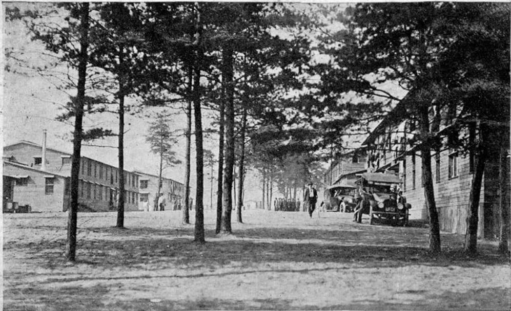
BARRACKS 312TH INFANTRY, CAMP MEADE, MD.