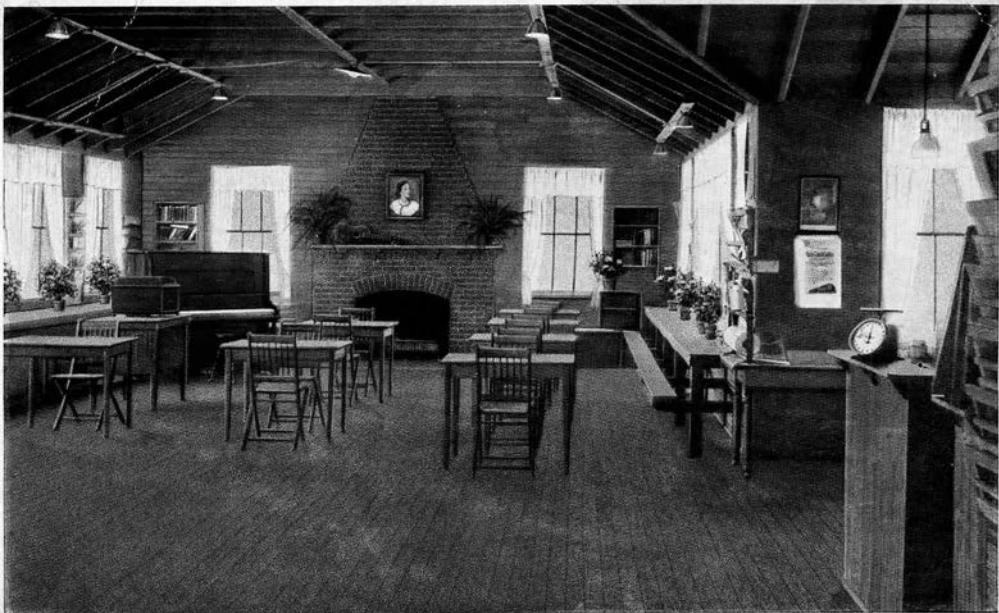
SOCIAL ROOM, Y. M. C. A. BUILDING, CAMP DODGE, IOWA.