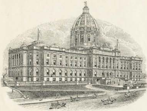
NEW STATE CAPITOL IN COURSE OF CONSTRUCTION.