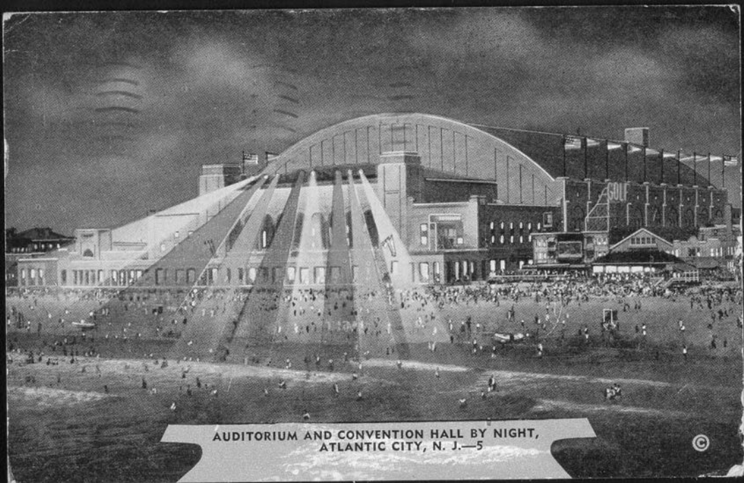
AUDITORIUM AND CONVENTION HALL BY NIGHT, ATLANTIC CITY, N. J.—5