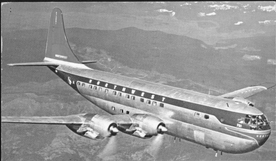
Northwest Airlines Stratocruisers—Finest... Fastest