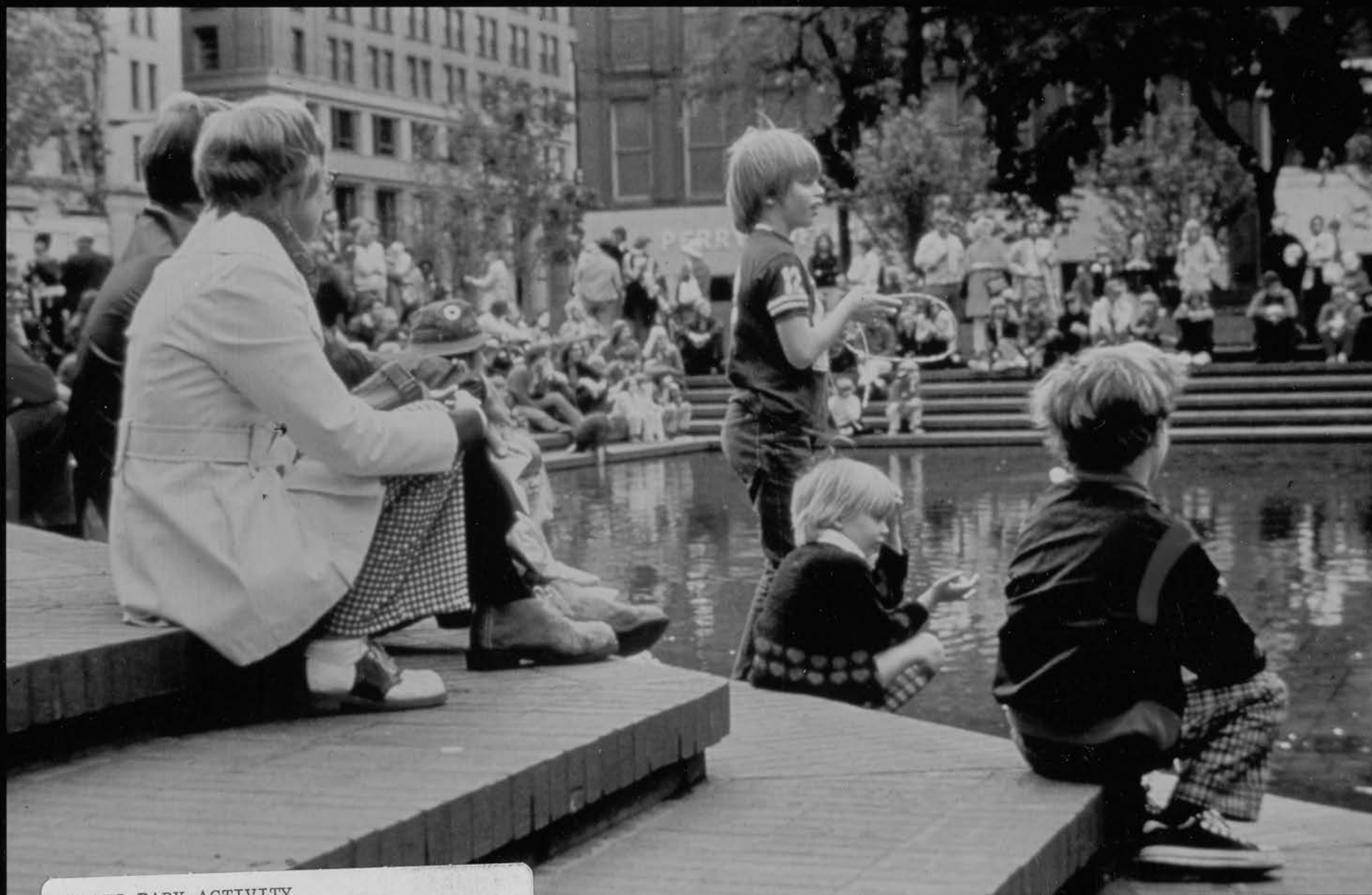
MEARS PARK ACTIVITY