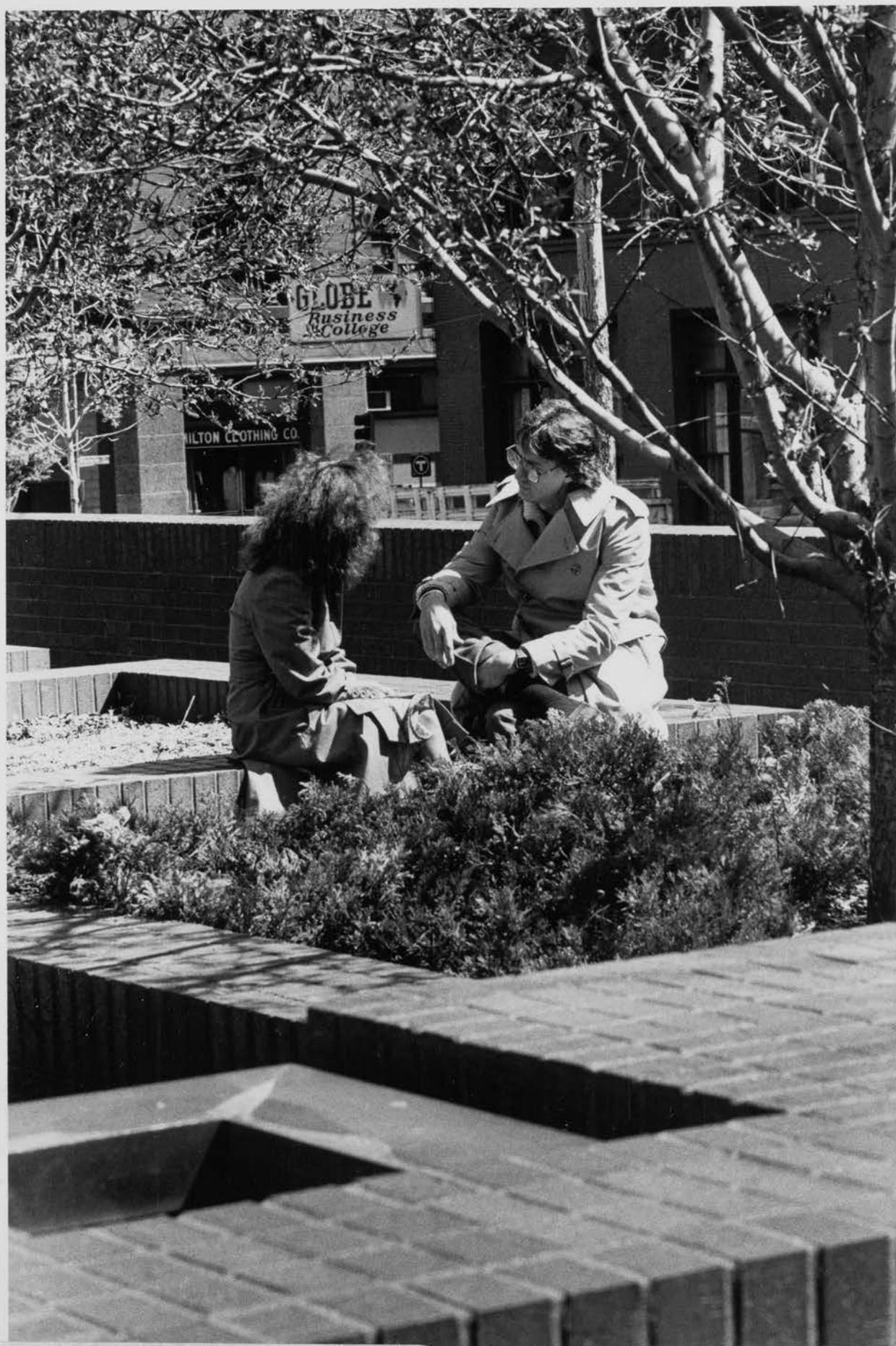
MEARS PARK ACTIVITY