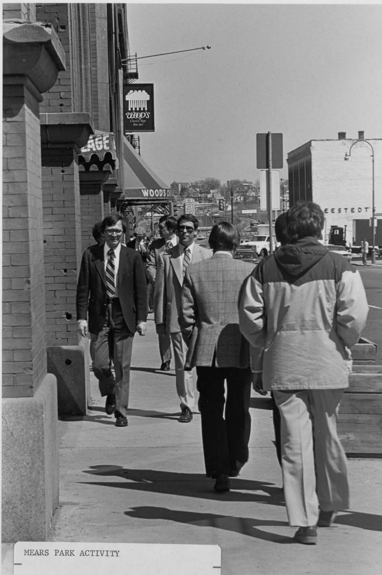
MEARS PARK ACTIVITY