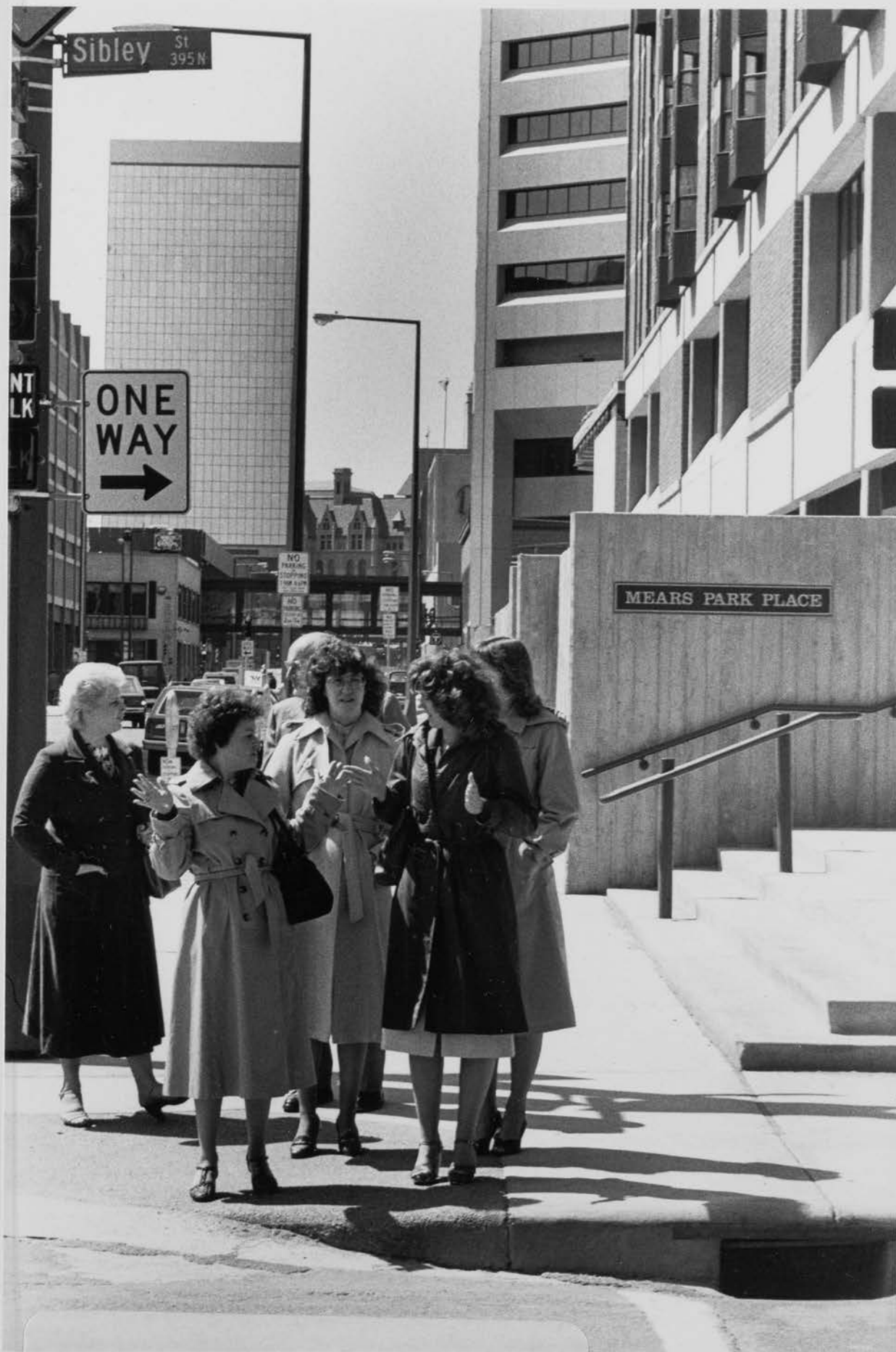
MEARS PARK ACTIVITY