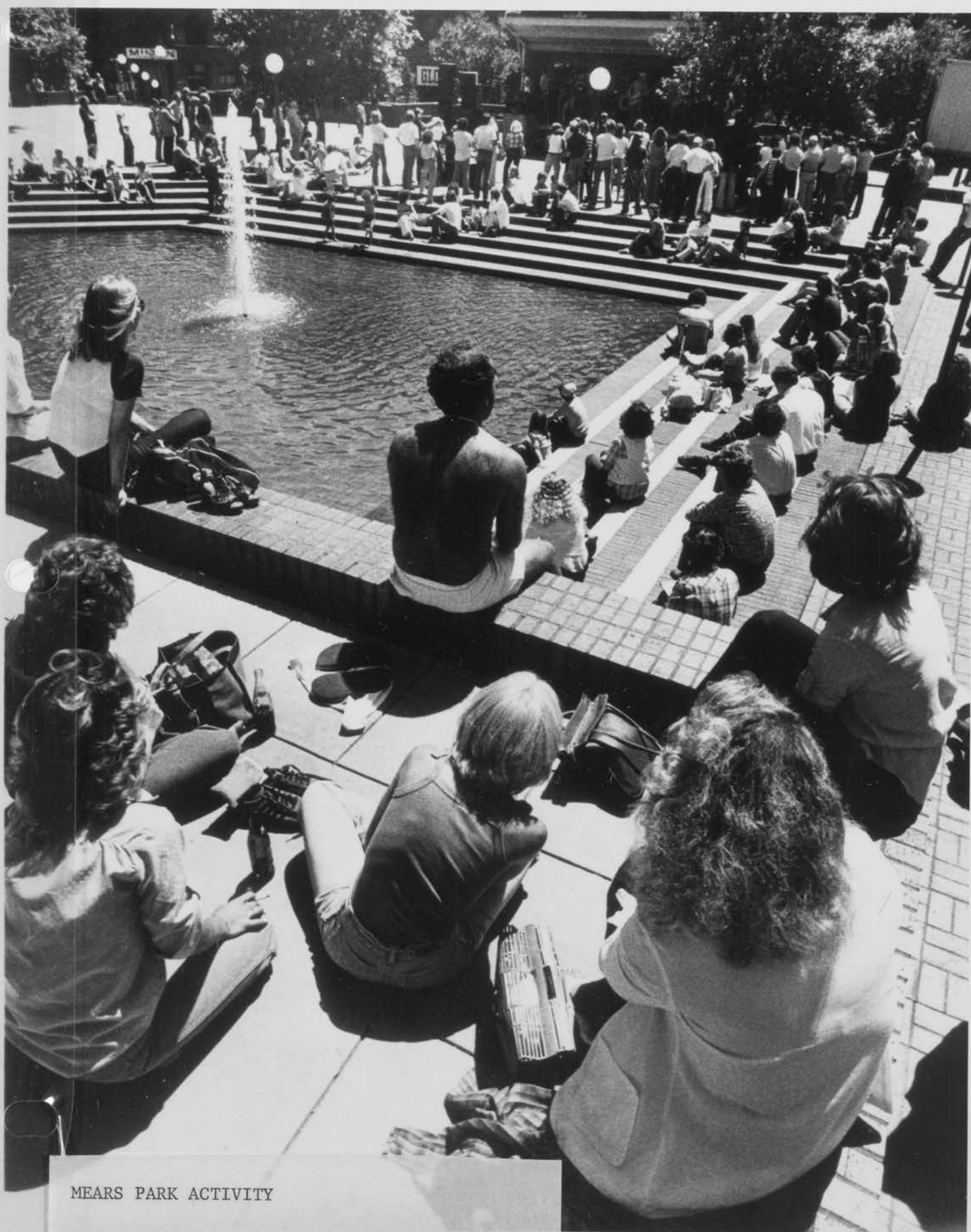
MEARS PARK ACTIVITY