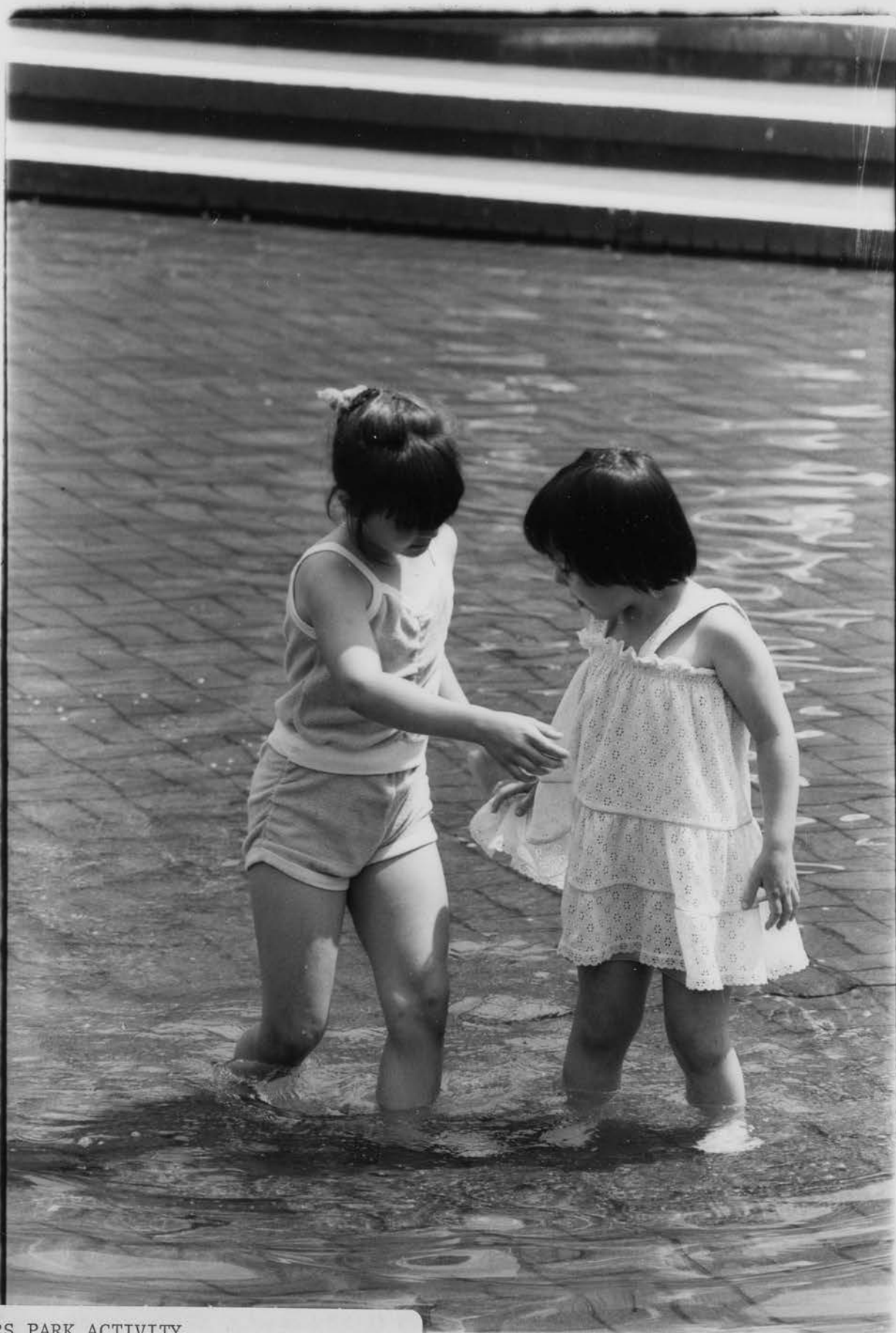
MEARS PARK ACTIVITY