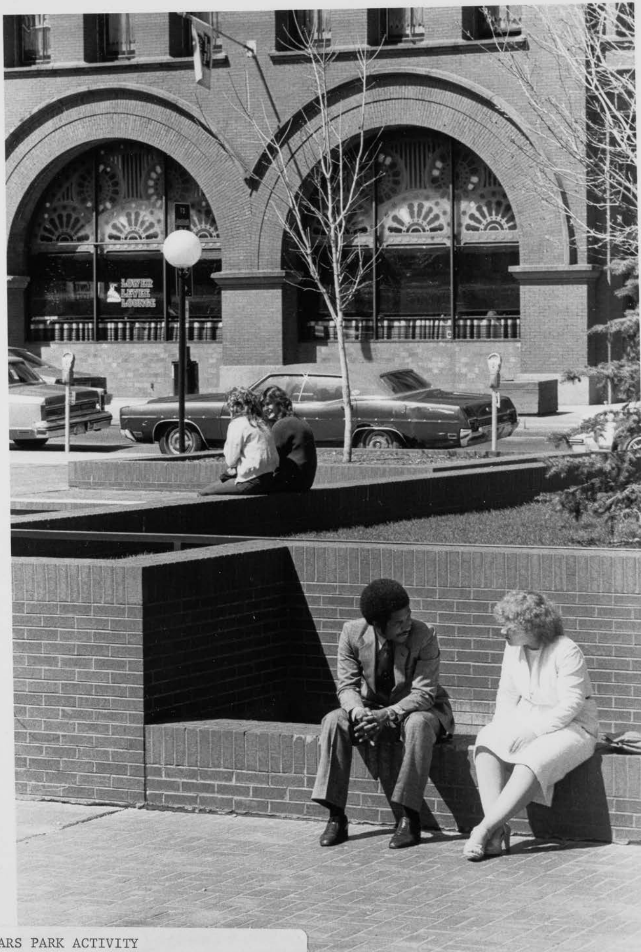
MEARS PARK ACTIVITY